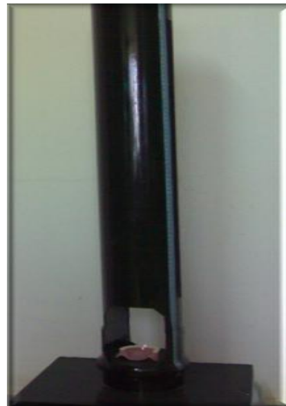
Figure (1): Schematic diagram of Falling-impact test.