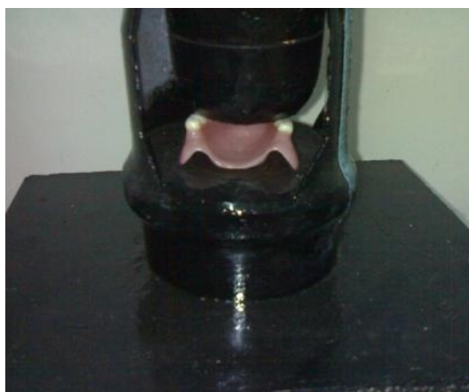
Figure (3): Denture position

radius 50 mm and a mass of 0.876 kg. the testing apparatus was placed on a flat surface. The denture was placed on the small table in the tube (Figure 3).