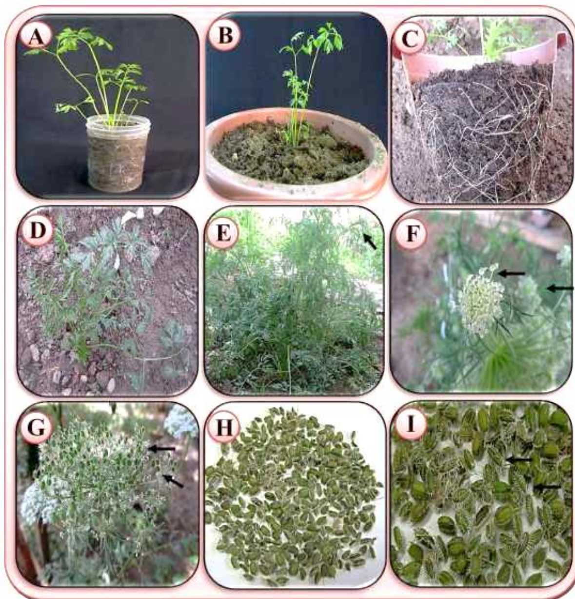
Fig. 2: Successful transplantation of regenerated carrot, Daucus carota L., plants in field conditions